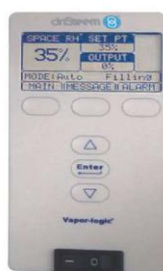
Vapor - 4 control panels