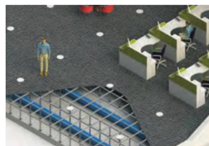
Exhibition Hall & Office Auxiliary Area