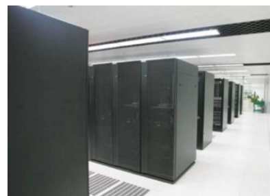
Other IT or Computer Equipment