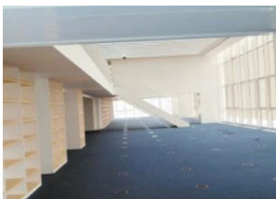
Training or Conference Hall